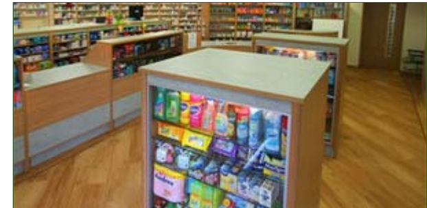
Counters & Showcases