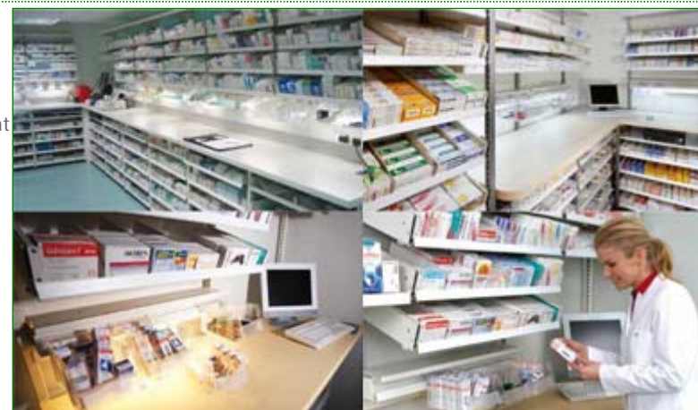
Z Series Pharmacy Work Station

* Based upon an average package size of 50 x 30 x 103 mm