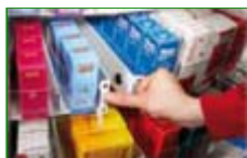
Easy to refill thanks to magnetic segments