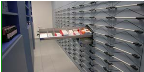
X Series Pharmacy Drawer Systems

Please browse through our product collections, if you cannot find a system that suits your requirements call our sales team.