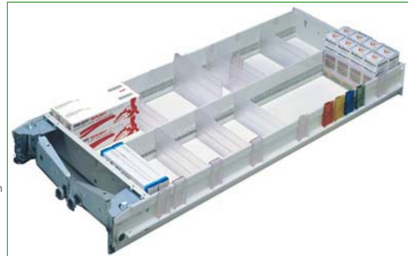
FZ Pharmacy Drawer with Solid Bottom