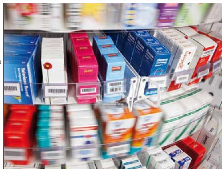
A Pharmacy Round Shelf in Use