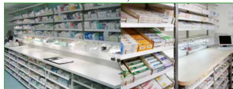
Pharmacy Work Stations & Pullout Drawers