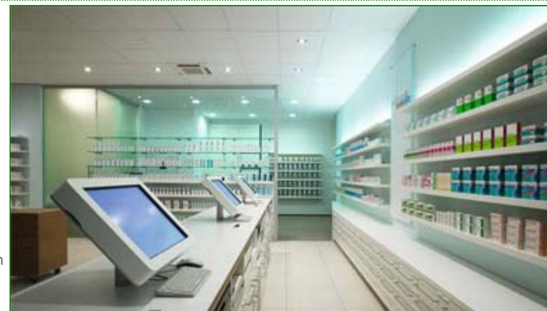
BZ Pharmacy Bench Drawer System