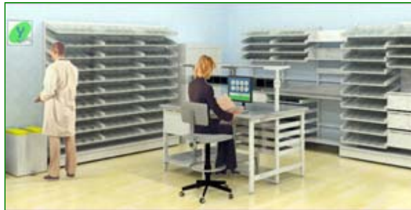
Y Series Pharmacy Pullout Shelves