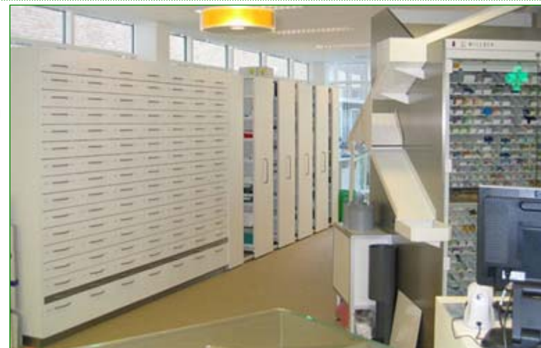
Z Series Pharmacy Storage Solutions

For quick access to a wide range of pharmaceuticals.