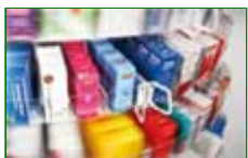
Simple operation through rotational shelves