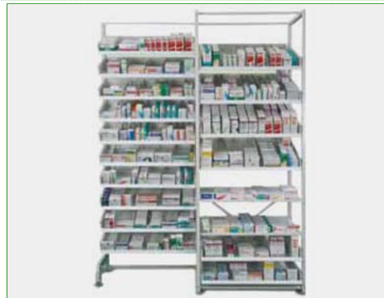
PZ Fast-Mover Pharmacy Pullout Shelving