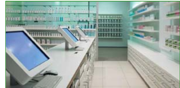
Z Series Pharmacy Drawer Systems

FPD Group Ltd X Y Z Series products are used by pharmacy establishments throughout the world.