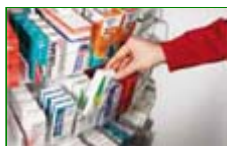
Quick removal of packages