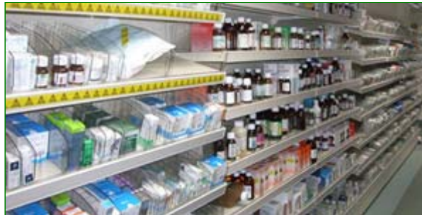
Pharmacy Shopfitting Shelving