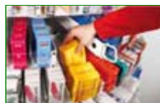
Observance of FIFO refilling process via refilling at the back