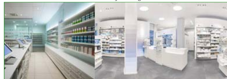
Z Series Pharmacy Installations