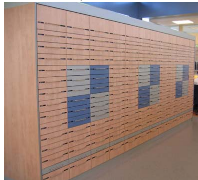
Z Series Full Height Pharmacy Drawers