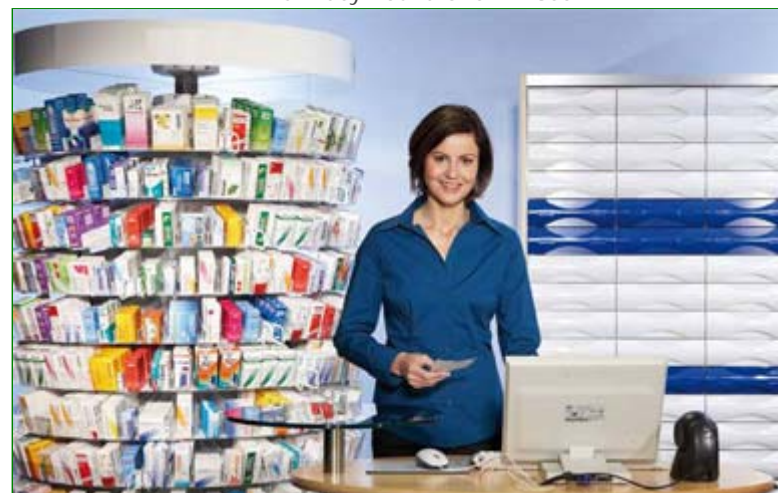
RZ Pharmacy Round Shelf Combined with Drawers