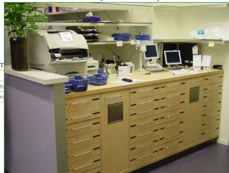
BZ Bench Drawers with Customised Drawer Fronts