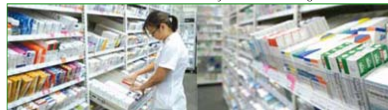
Z Series Fast Mover Pharmacy Shelving