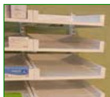
Half Width Drawer