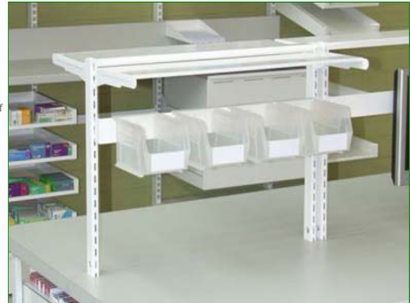
Work Station Work Surface