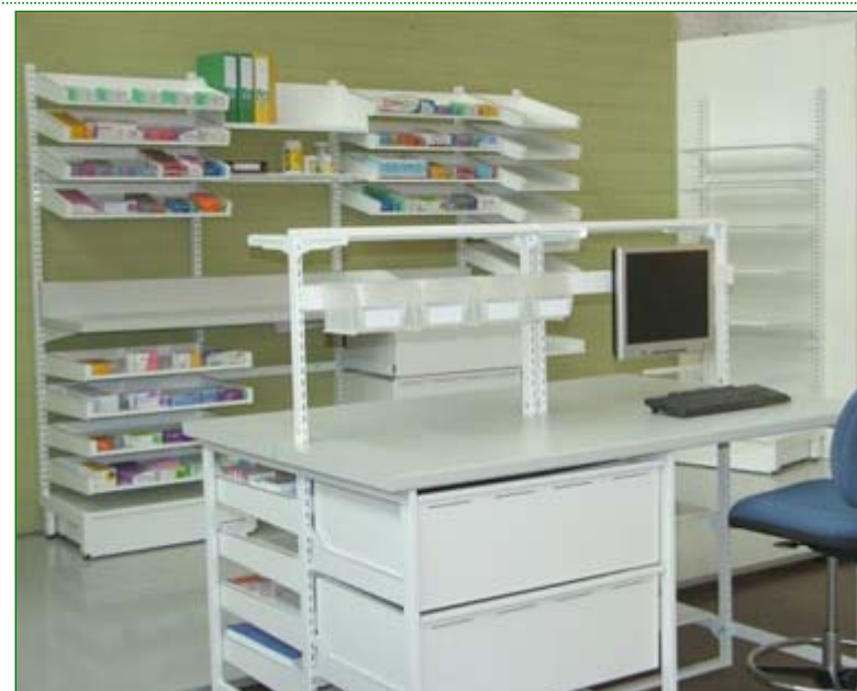
BY_2D Two Module Double Sided Pharmacy Work Station