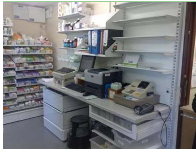
Y Pharmacy Drawers in Shelving Unit