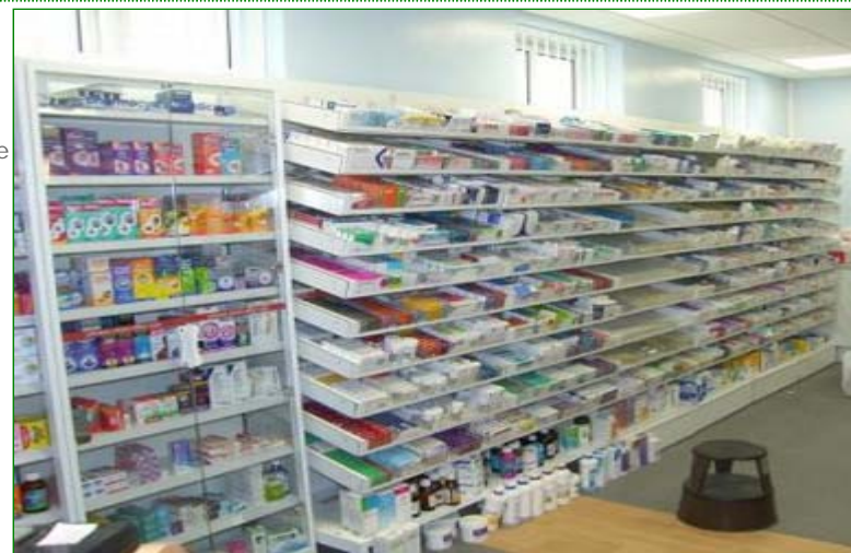
Pharma Drawer Full Height Shelving - Up to Ten Shelves Per Bay

FY_003T Full Height Pharmacy Shelving 2 x Slotted Perimeter Uprights 1 x Workshelf & Pair of Brackets 4 x Pullout Shelves with Divider Sets 1 x Base Plinth Drawer with Divider Set 2 x Deep Storage Drawer with Divider Sets Product Code: FPD-08710