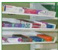
Reduced Depth Drawer