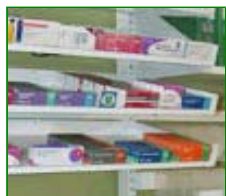
Reduced Depth Drawer