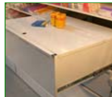
Optional Top Shelf