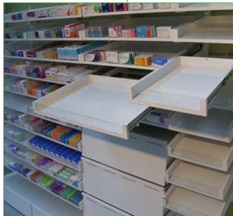
Pharmacy Pullout Shelving System