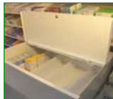
Optional Drawer Top shelf (lifted)