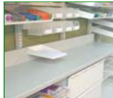
Work Surface Upstand