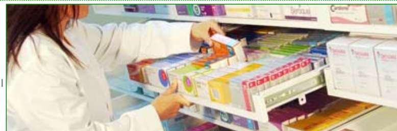
Y Series Pharmacy Pullout Shelf