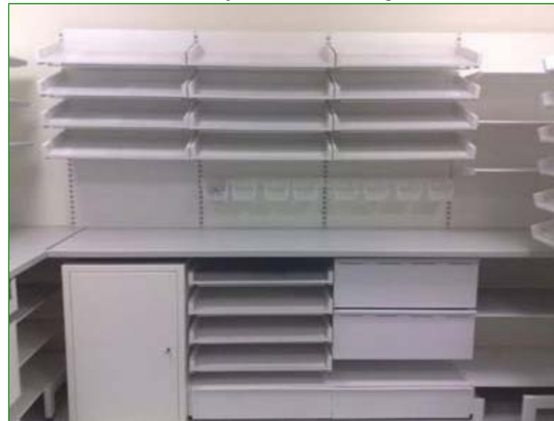
Pharmacy Deep Drawers And Plinth Drawers